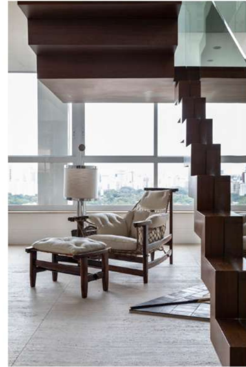
PHOTO 2 OF 3 The Jangada chair by Jean Gillon, accompanied by a lamp by Sergio Rodrigues, occupy the space alongside the bespoke staircase