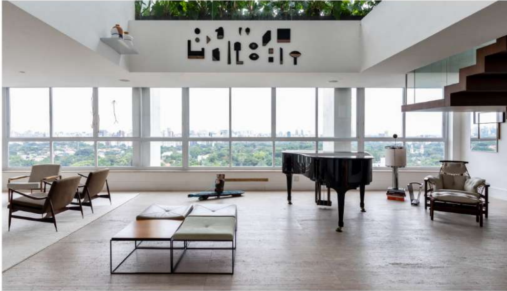
ABOVE The lofty abode boasts scenic views that one can gaze at through the glass windows

Maluhy, who heads her namesake design and architecture studio with offices based in both London and Brazil, sought to fill the home with a soulful character inspired by the owners' love of art as well as the striking surrounding view.