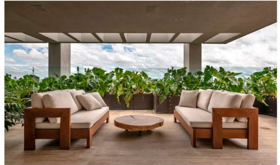
PHOTO 1 OF 2 The cosy living area allows one to luxuriate outdoors and enjoy a moment of peace

Outside, the eye is immediately drawn to the lush green foliage surrounding the open area. Glass doors sliding through iron frames connect the interior space to the outdoor area. The design team worked closely with landscape designer Renata Tilli to best showcase the verdant greens that line the perimeter of the veranda. A couple of sofas and a wooden coffee table from atelier Pedro Petry create a welcoming retreat where one can lounge and soak in the peaceful ambience.