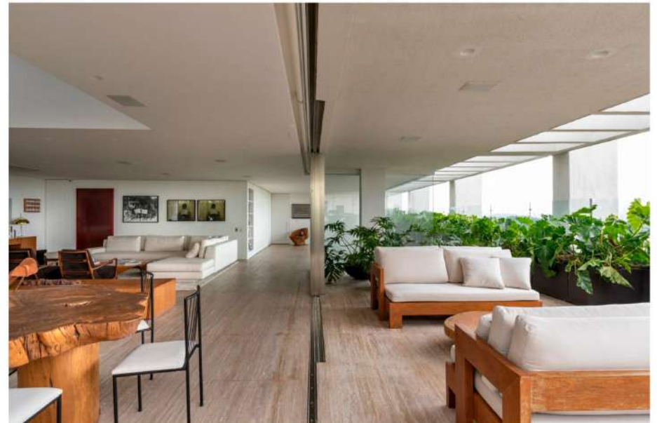
PHOTO 2 OF 2 Glass doors sliding through iron frames connect both spaces