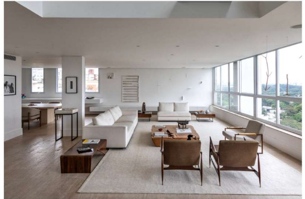
ABOVE The lower living room, furnished with vintage furniture, emits a serene and calming vibe

"The personality of the couple, who are both passionate about art, design, music and philanthropy, was key to understanding how to design the perfect setting to display their art and design collection; we also had to accommodate an intimate venue for one of the owner's main hobbies: jam sessions with musicians and friends around the grand piano," Maluhy explains. "The style needed to be minimalistic and neutral, predominantly white with plenty of natural light and simple lines, so as to provide a stage where the exquisite collection and the musical soirées could stand out."