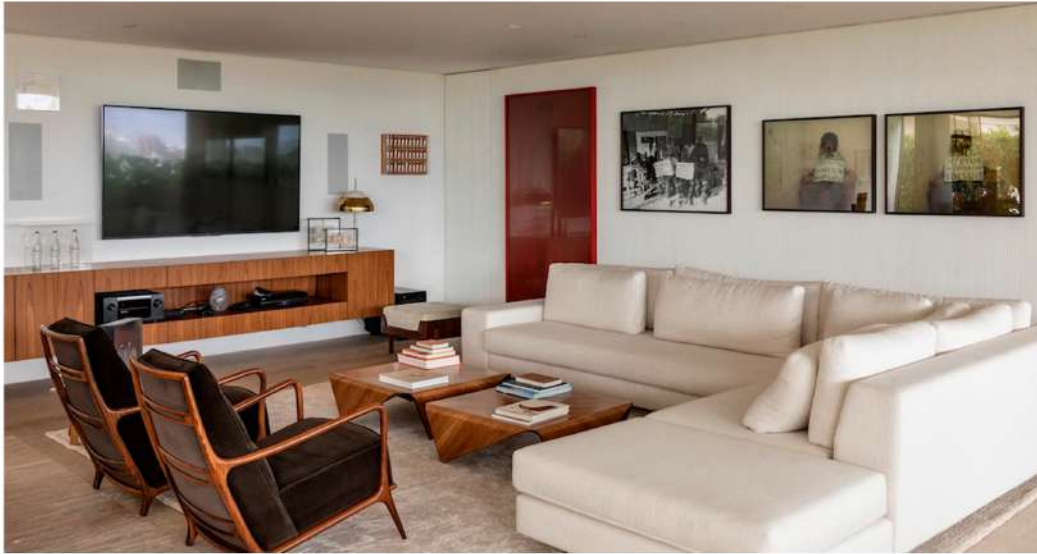
ABOVE The upper living room is an alternate communal living space

A large white linen sofa from Casual Móveis adds to the snug appeal of the living area. Chic wooden coffee tables by Jorge Zalzipin as well as armchairs with cushions upholstered with brown velvet add warmth and depth. A stylish console crafted from Pau Ferro wood designed by Maluhy is home to a couple of smaller artworks and trinkets.