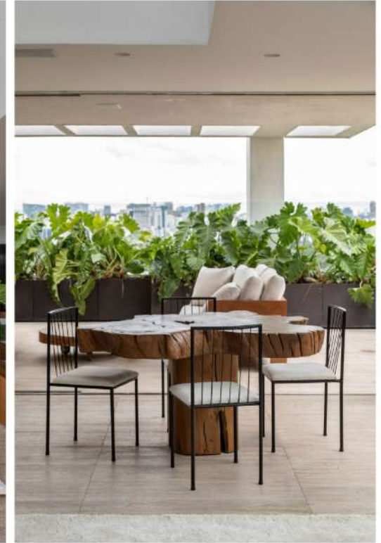
ABOVE A small dining area, with a table by Hugo Franca and chairs by Geraldo de Barros, offers a scenic spot for guests to gather

Upstairs, the previous open terrace was rebuilt from scratch and converted into an alternate communal space that also houses the couple's master bedroom. The ceiling is built with a set of wooden automatic brise soleils, which helps to regulate the natural illumination.