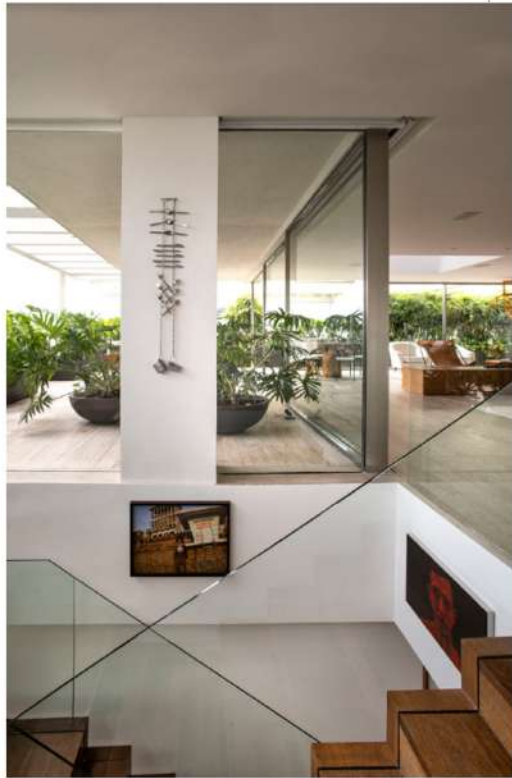
PHOTO 3 OF 3 The floating staircase, crafted from Cumaru wood and glass, leads to the upper mezzanine

The grand piano takes pride of place beside a bespoke floating staircase crafted from Cumaru wood, typical of the Northern region of Brazil, as well as glass guardrails. The lofty living space opens up to the upper mezzanine, flooding the space with natural light. An art installation by Brazilian artist Ana Mazzei draws the eye upwards, while Capri benches by Jorge Zalszupin create a cosy seating arrangement for soirées and jam sessions held near the piano.