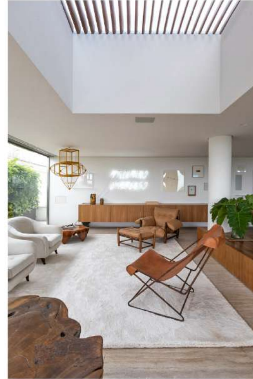
ABOVE The design team added an automated brise-soleil to help control light flooding into the space

The grand piano takes pride of place beside a bespoke floating staircase crafted from Cumaru wood, typical of the Northern region of Brazil, as well as glass guardrails. The lofty living space opens up to the upper mezzanine, flooding the space with natural light. An art installation by Brazilian artist Ana Mazzei draws the eye upwards, while Capri benches by Jorge Zalszupin create a cosy seating arrangement for soirées and jam sessions held near the piano.